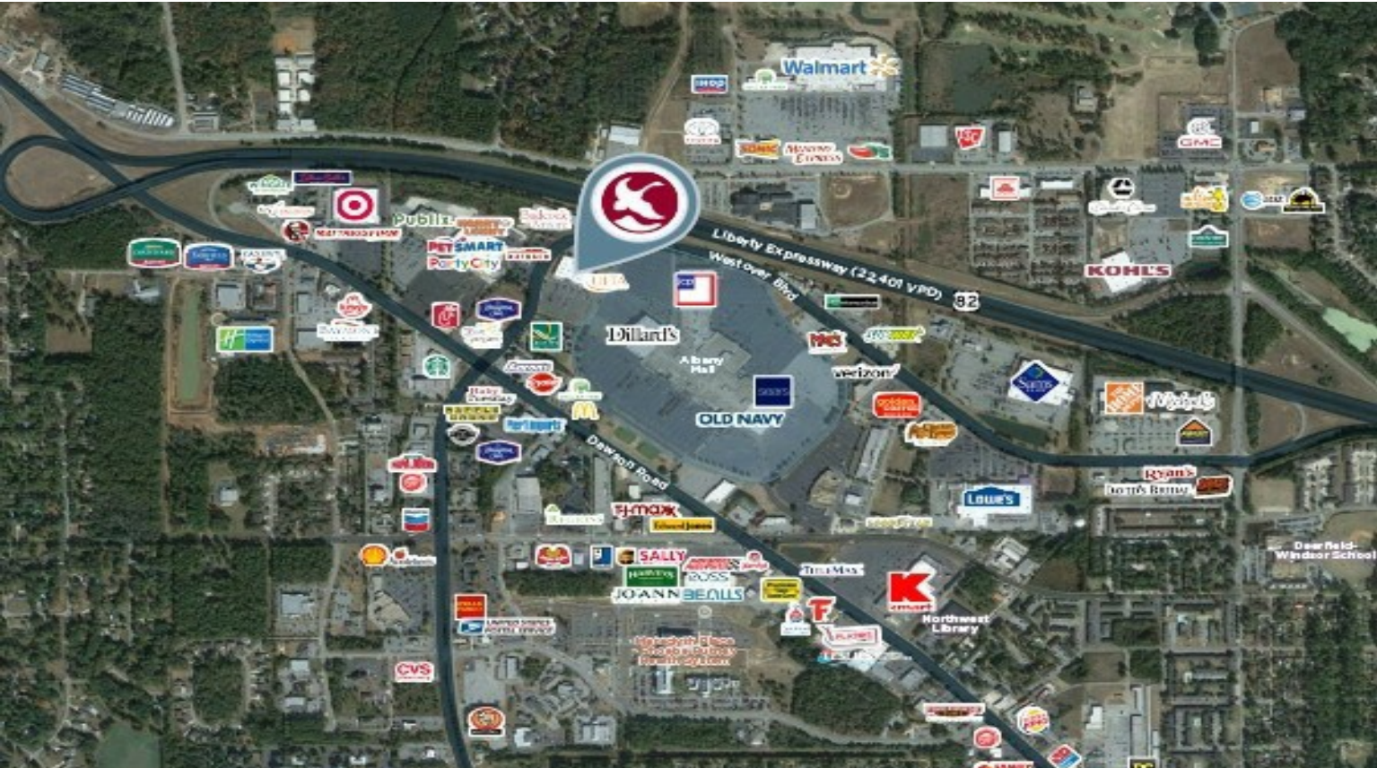
AERIAL -WESTOVER Rd. ALBANY